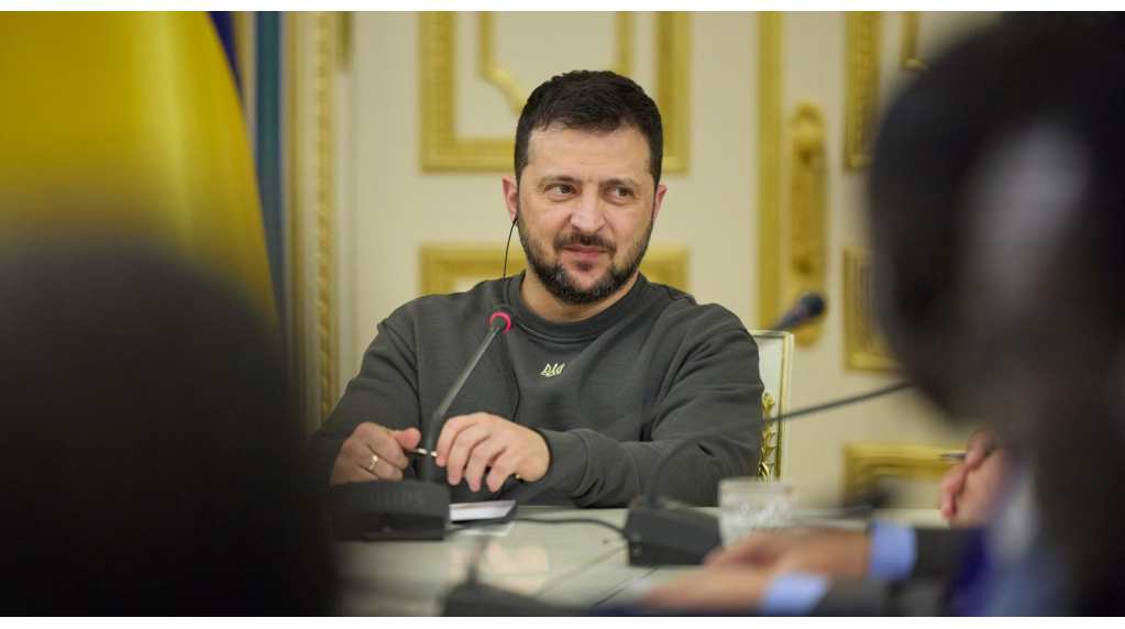
Caption: President Zelenskyy during a meeting with African journalists in Kyiv in November, 2023.

the views and opinions expressed in this article are solely the author's and do not represent the opinions, views and beliefs of Daily Revelation Newspaper