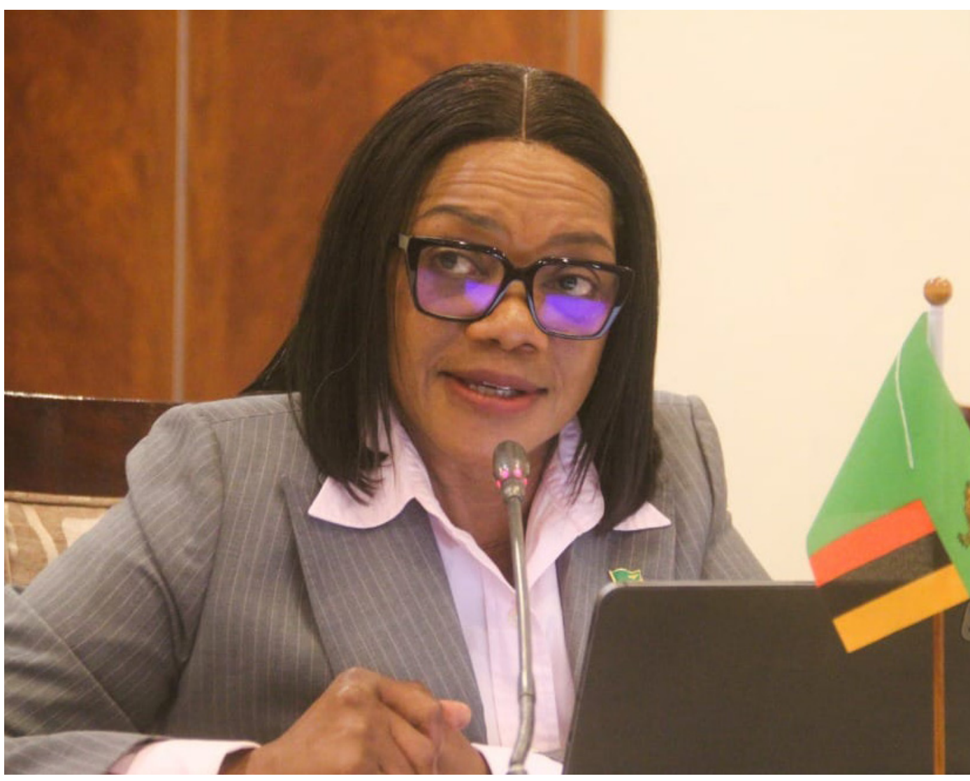
Minister of Heath - Silver MAsebo

You are sending patients to go and buy drugs when drugs are there."