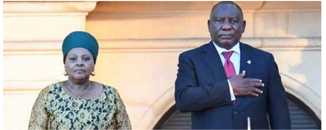
South African President Cyril Ramaphosa gestures while standing next to Speaker of the National Assembly of South Africa Nosiviwe Mapisa-Nqakula