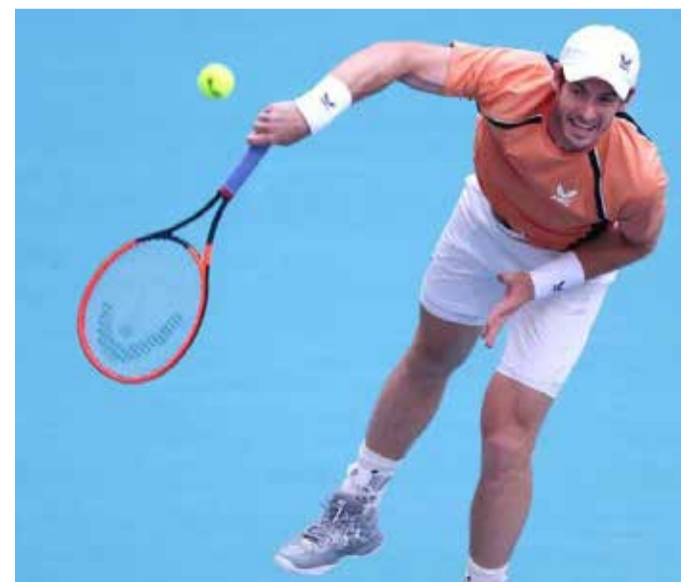
Andy Murray became the third active player to earn 30 wins at the Miami Open after Novak Djokovic (44) and Rafael Nadal (40)