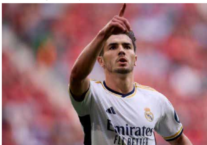
Morocco missed Brahim Diaz at the Africa Cup of Nations earlier this year.