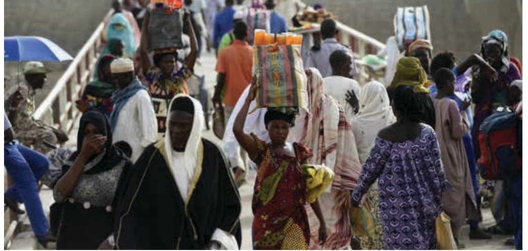
FILE PHOTO: People cross the N'Gueli bridge, marking the border between Chad and Cameroon near N'Djamena.

had has asked US troops to halt activities at an air base near the capital of N'Djamena, the sole place American military presence in the country, several media outlets reported this week, citing letters sent by the country's armed forces minister, Air Force Chief of Staff Idriss Amine Ahmed.