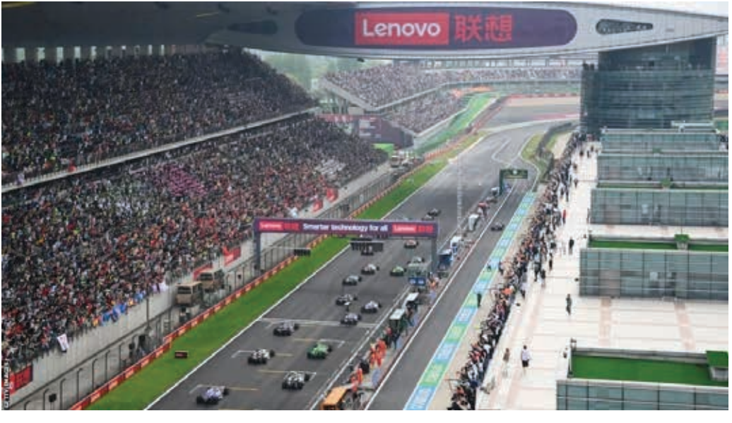
he Chinese Grand Prix returned to the F1 calendar for the first time since 2019

After that, he calmly navigated the rest of the race, well clear of the rest of the field, to take his fourth win in five races this year victorious in all the events he has finished. BBC