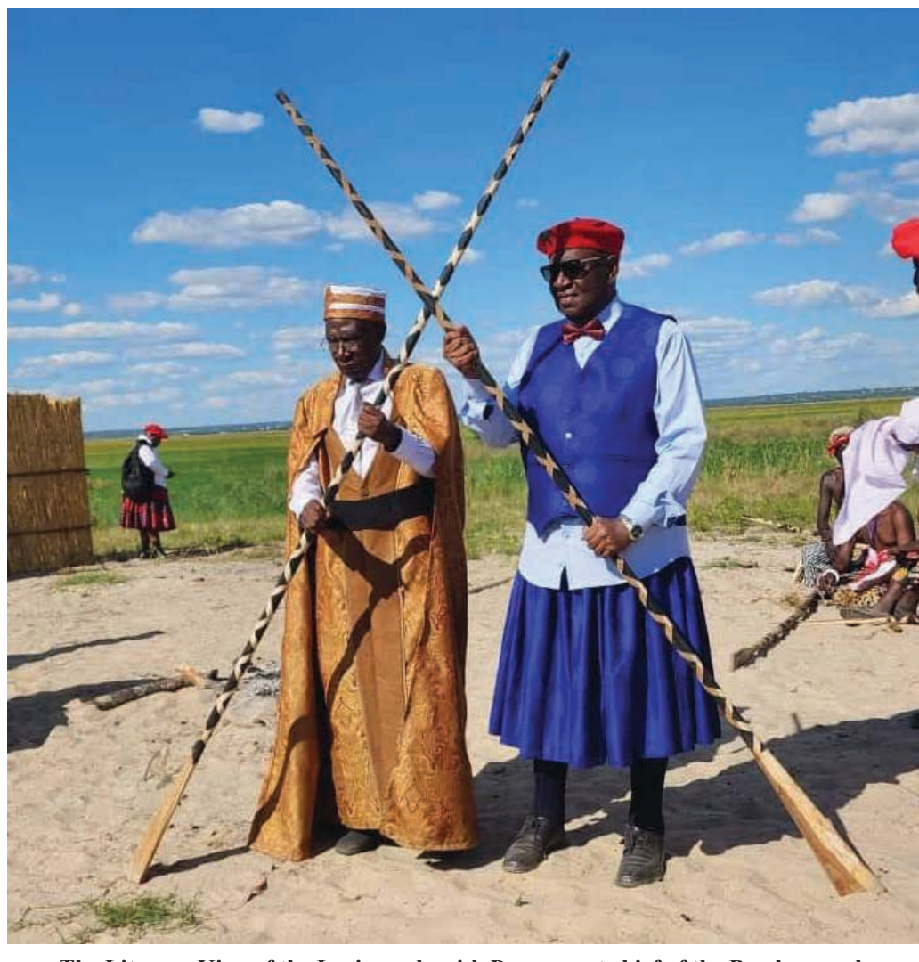
The Litunga, King of the Lozi people with Paramount chief of the Bemba people Chitimukuku during the recently held Kuomboka traditional ceremony in Mongu