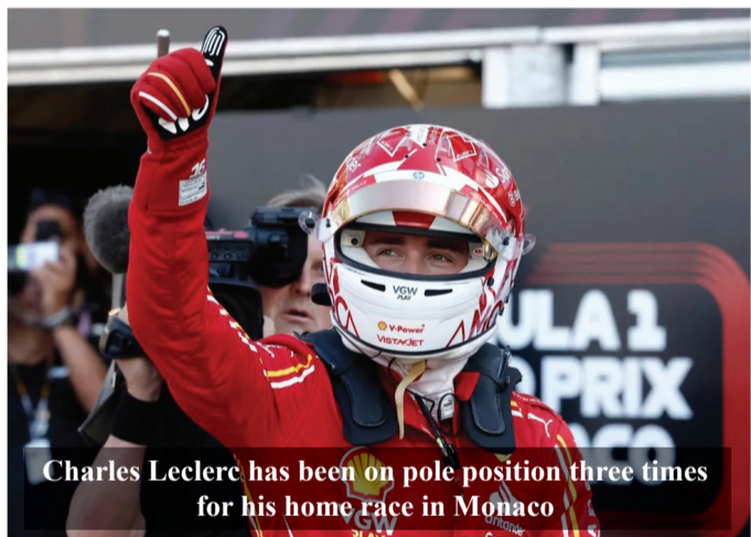
Charles Leclerc has been on pole position three times for his home race in Monaco

Charles Leclerc said after taking pole position for the Monaco Grand Prix that he had dreamt of winning his home race "since being a kid". The dream is close to becoming reality - they say that taking pole is 90% of the way to winning the race at Monaco, where overtaking is almost impossible. But Leclerc knows