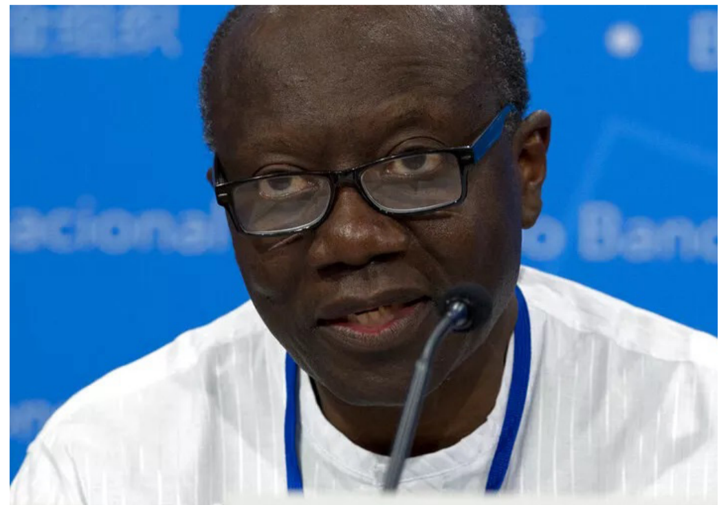
Ghana's Finance Minister Ken Ofori-Atta speaks during the G-24 news conference at the World Bank/IMF Spring Meetings, in Washington, on April 19, 2018.