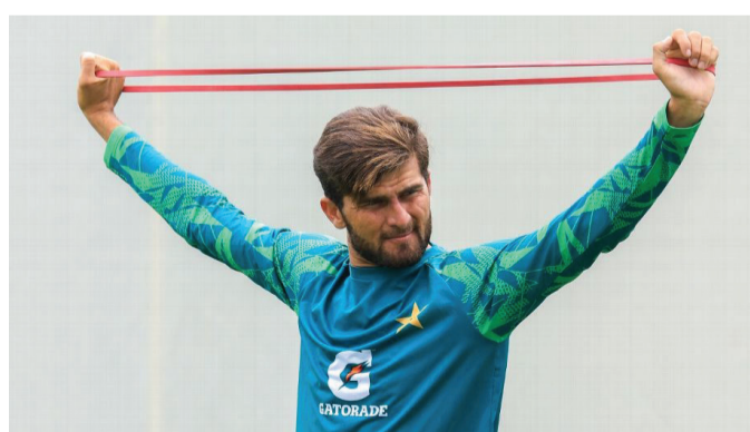
Shaheen Shah Afridi during training

the PCB put out a statement on their website containing remarks from Shaheen offering Babar warm words of encouragement. It would emerge that Shaheen never said the words attributed to him, and once he planned to make that public, Naqvi rushed to Kakul - where the players were undergoing a military training camp. While Shaheen remained thoroughly unimpressed and betrayed by the manner of his dismissal, an uneasy truce was understood to have been reached. That Shaheen turned down another chance at a leadership position, though, demonstrates how uneasy that truce still is. Shaheen is among the core leadership