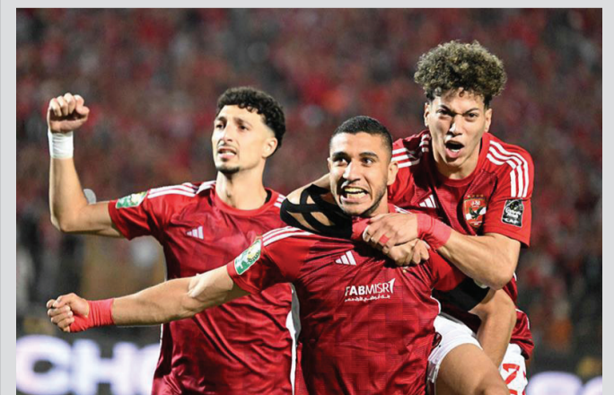
Al-Ahly crowned African champions for 12th time