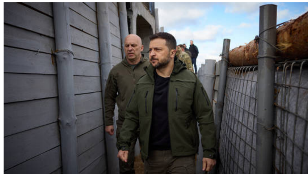
FILE PHOTO: Vladimir Zelensky inspecting the construction of fortifications at an undisclosed location.

Ukraine's leader urges the world to unite against Moscow