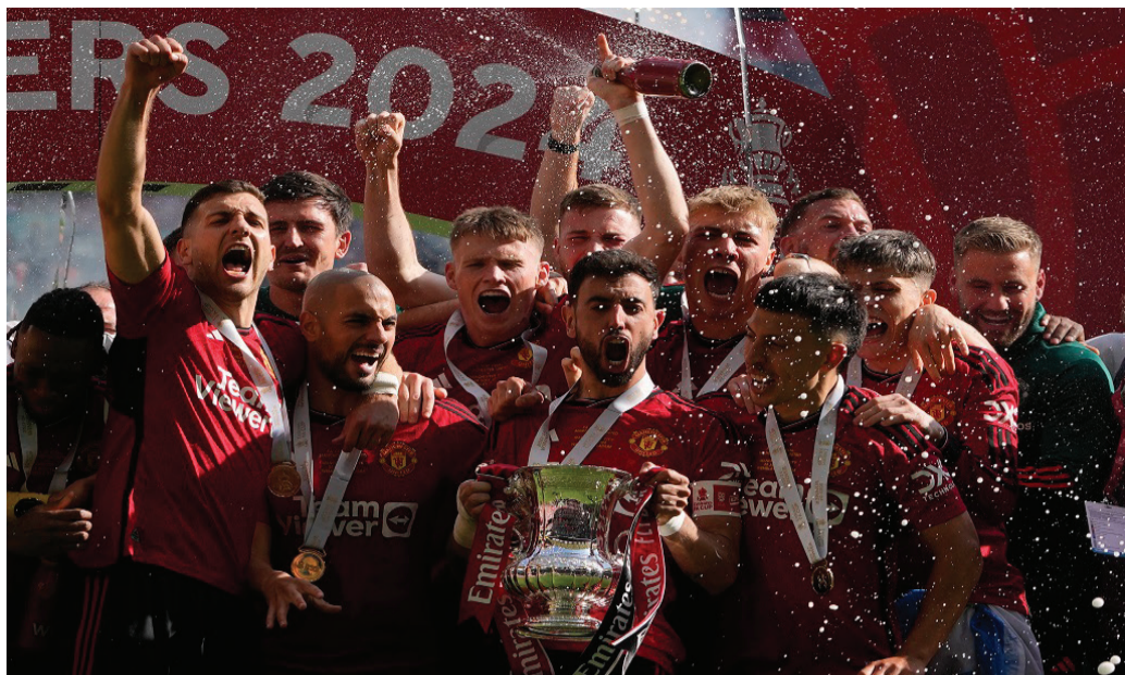
Triumphant Man United celebrate 2nd trophy in 2 years after beating city rivals Man City 1-2 at Wembley Stadium