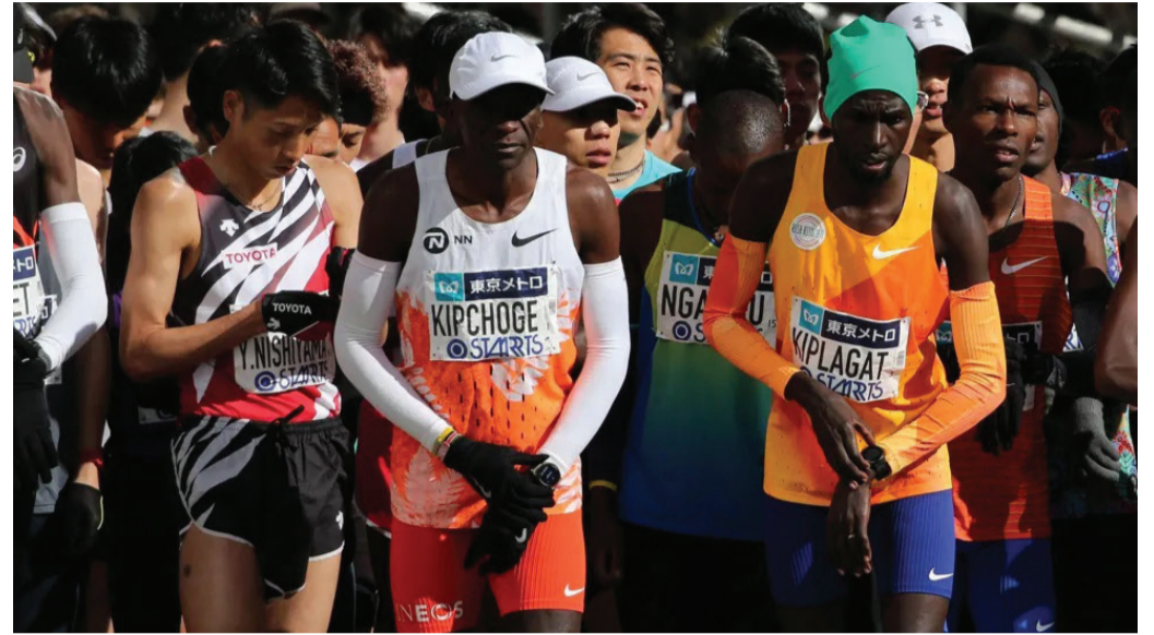
Kipchoge says the online abuse caused sleepless nights and hindered his performance in March's Tokyo Marathon