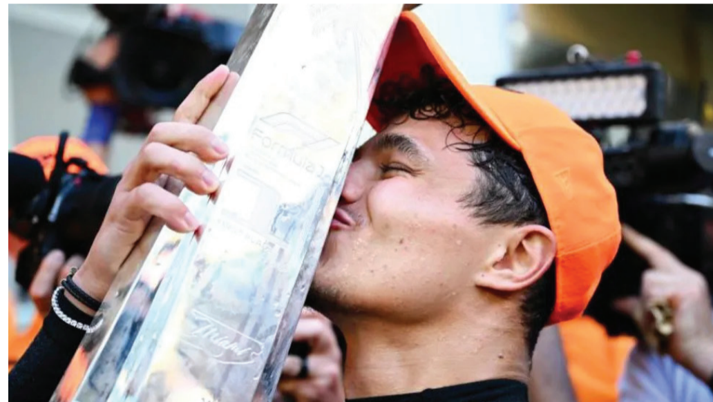
Lando Norris' victory came in his 110th grand prix