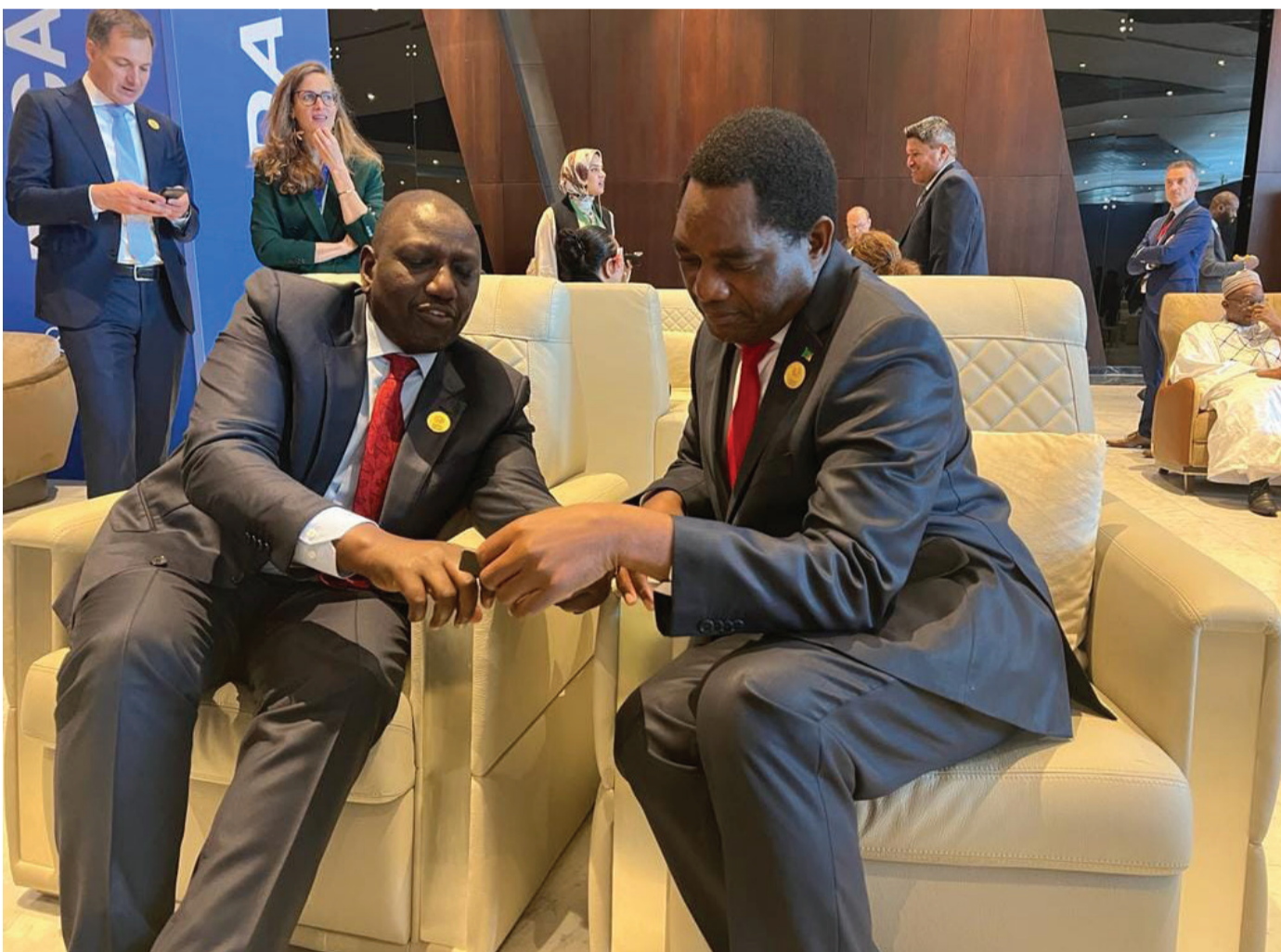
FILE PICTURE: President Hakainde Hichilema with Kenyan President William Ruto