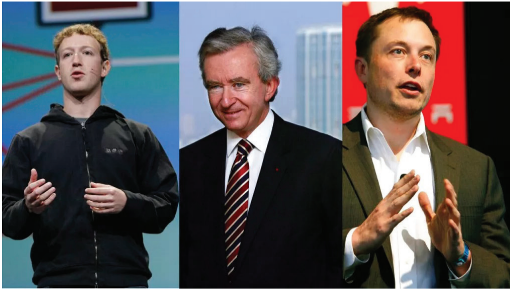
Facebook CEO Mark Zuckerberg L, Bernard Arnault, chairman of LVMH Moët Hennessy Louis Vuitton Group M, Tesla product architect and CEO Elon Musk R

B ernard Arnault, CEO of LVMH, the world's leading luxury goods company, continues to dominate as the world's wealthiest individual as of May 1, 2024.