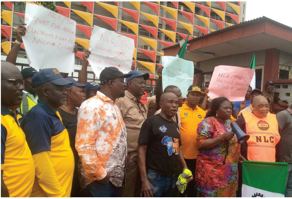
NLC officers picking electricity office

labour for the restoration of the power subsidy and the reversal of the hike in electricity tariff.