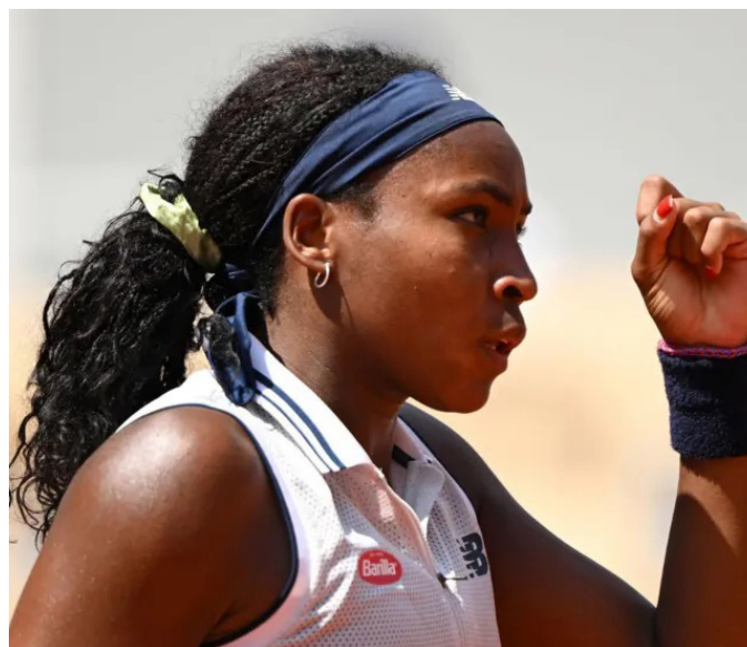
Coco Gauff won her maiden Grand Slam title at the US Open last year

American third seed Coco Gauff reached the French Open