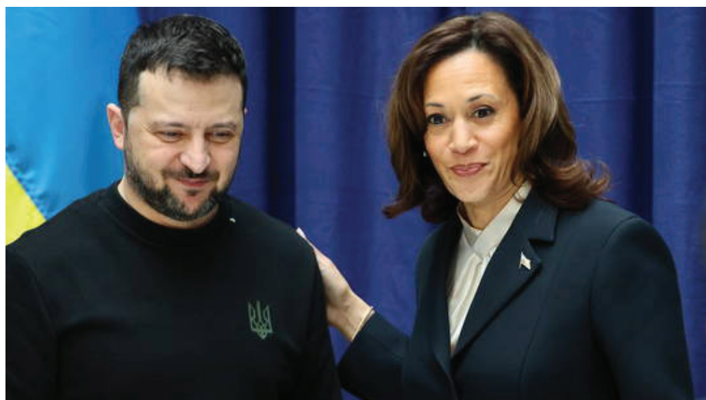
Ukraine's Vladimir Zelensky and US Vice President Kamala Harris at the Munich Security Conference