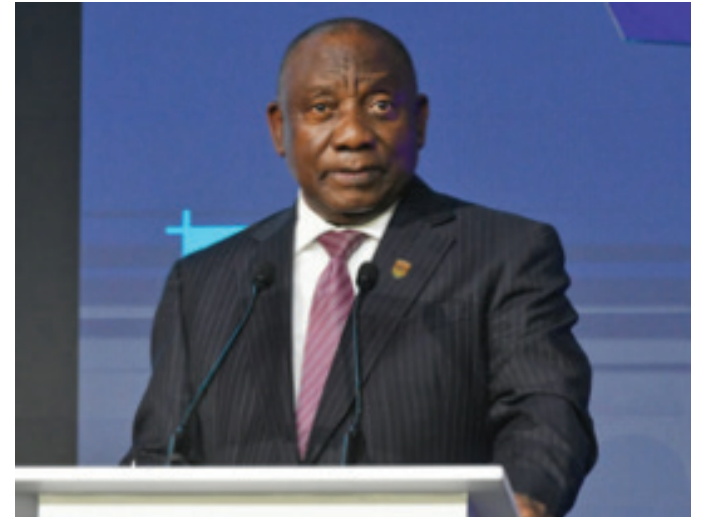
President Cyril Ramaphosa

"What this election has made plain is that the people of South Africa expect their leaders to work together to meet their needs. They expect the parties for which they