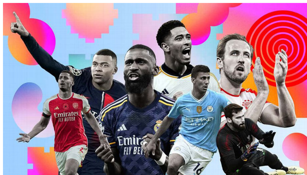
This year's list is filled with new faces like William Saliba, veteran quality like Harry Kane, and the next generation of stars led by Kylian Mbappe and Jude Bellingham

The Premier League reigns supreme again: In total, 38 members of the FC 100 this year are from the English top flight, with a range of clubs beyond Manchester City, Liverpool and Arsenal contributing to its strength in depth. LaLiga hangs tough in second place with 19 names on the list, though the German Bundesliga has come