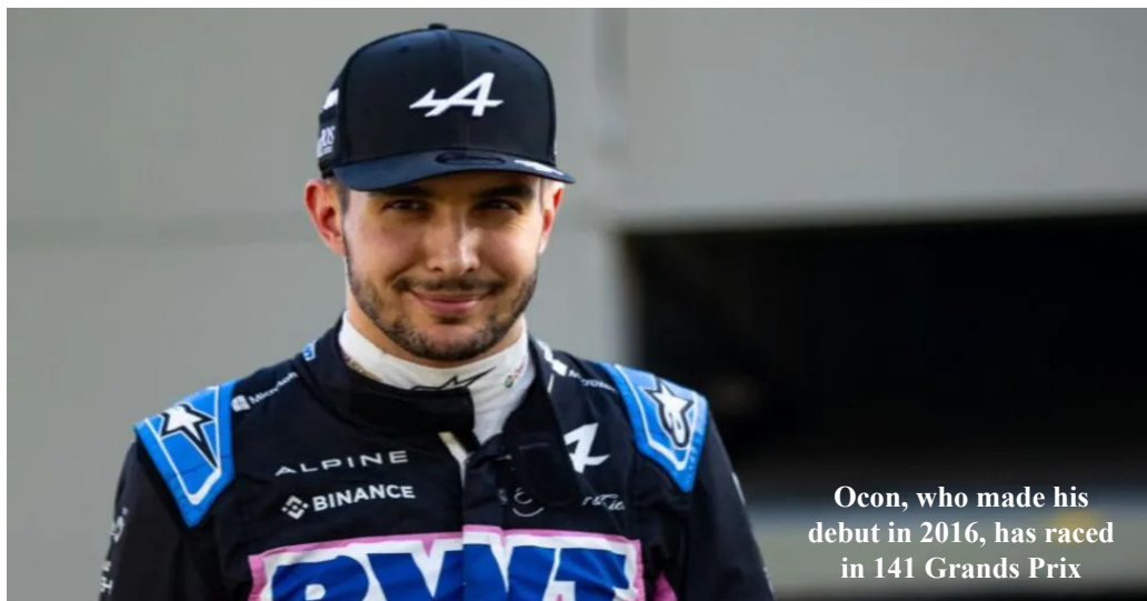
Ocon, who made his debut in 2016, has raced in 141 Grands Prix

Esteban Ocon is to leave Alpine at the end of the year after five seasons with the French team.