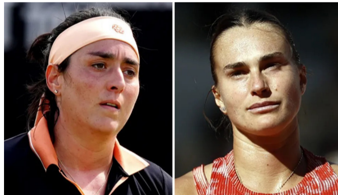
Ons Jabeur (left) and Aryna Sabalenka were both beaten in the French Open quarter-finals at Roland Garros, where the Olympic tennis competition will be played

When the Boston Celtics hoisted the Larry O'Brien Trophy for the 18th time in franchise history on Monday night, they became the sixth different NBA champion in as many years.