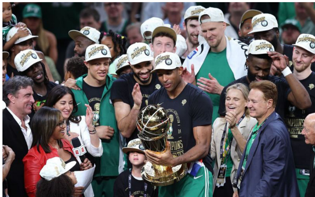
The Boston Celtics captured title 18 on Monday night. What factors can turn this run into a dynasty?