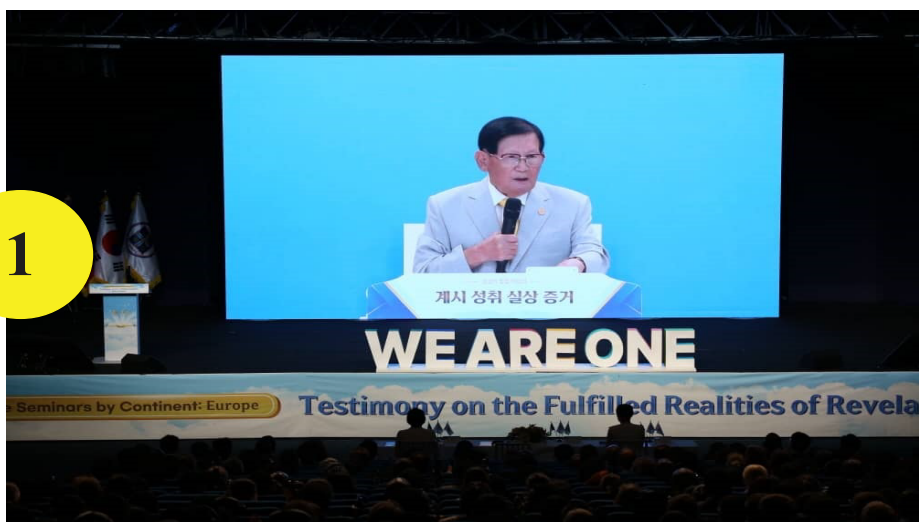
A video lecture by Chairman Lee Man-hee of Shincheonji Church of Jesus titled "Testimony on the Fulfillment of Revelation" is being shown at the Continental Word Seminar held in Paris, France on the 15th (local time).

Meanwhile, according to Shincheonji Church of Jesus, as of June 5th this year, MOUs have been signed with a total of 12,538 churches in 83 countries overseas. Additionally, 1,341 churches in 41 countries have joined Shincheonji Church of Jesus and changed their signage. Furthermore, as of the end of May, the number of domestic and international pastors currently taking Bible education courses at Zion Christian Mission Center has reached 5,614.