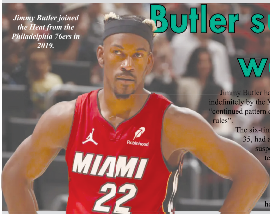
Jimmy Butler joined the Heat from the Philadelphia 76ers in 2019.