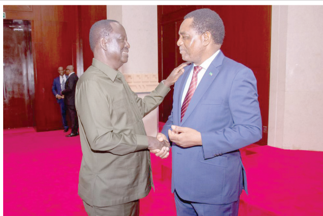
Africa united! President Hakainde Hichilema and former Kenyan Prime Minister Raila Odinga share a moment of solidarity as they shake hands on the sidelines of the African Heads of States Energy Summit in Tanzania

GBM has right to seek prostate cancer, heart treatment - Judge