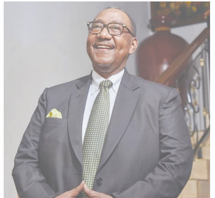
FILE PICTURE: Convicted former Defence minister Geoffrey Bwalya Mwamba

Convicted former Defence minister Geoffrey Bwalya Mwamba has told the court that his health is deteriorating rapidly due to the refusal by the Zambia Correctional Service (ZCS) to allow him to seek expert and emergency medical services for prostate cancer and heart ailments in South Africa and India. (To page 2)